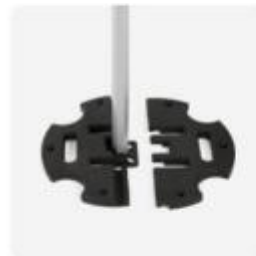
Cast iron base