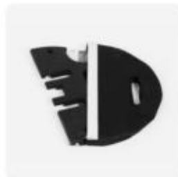
Cast iron base with bag