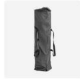
Standard protective cover