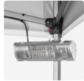
Radiator 500 W