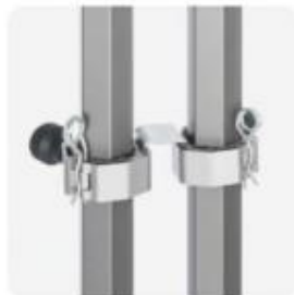
Tent's leg connector