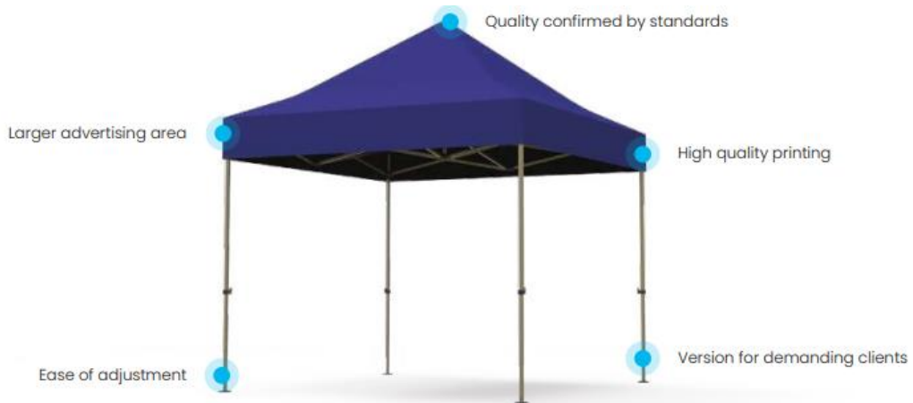
A rich basic colours palette of the sheathing